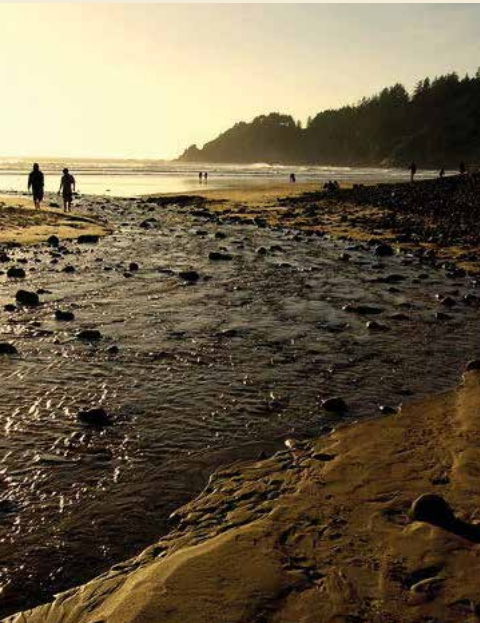
Short Sand Beach

The 2½ mile Cape Falcon Trail begins at the northwest parking lot along Highway 101. A quick ½ mile hike to the Kramer Memorial gives way to a brilliant overlook of Short Sand Beach. Continue the rest of the way out to Cape Falcon, through the high-growing salal, where on a clear day you can see north all the way to Tillamook Head and south to Cape Lookout.