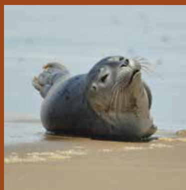
Baby Harbor Seal