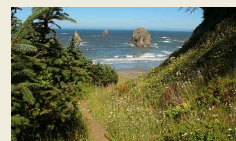
Trail to China Beach

Through hikers must walk on the shoulder of Highway 101 and over the bridge, then pick up the Oregon Coast Trail on the north side behind the guardrail, or continue on to North Island parking. From here, take the moderately difficult trail through Sitka spruce with peek-a-boo ocean views on your way to China Beach.