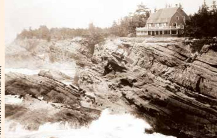
“The showplace that was”

seascapes, towering storm waves, and glimpses of migrating whales from December through June.