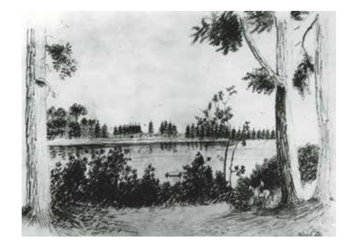
Sketched from a U.S. Navy encampment on the banks of the Willamette River circa 1841, this drawing shows the original Willamette Mission on the opposite riverbank.

Note: Trails flood during heavy rainstorms in winter and spring. Call 503-393-1172 x40 for closure information.