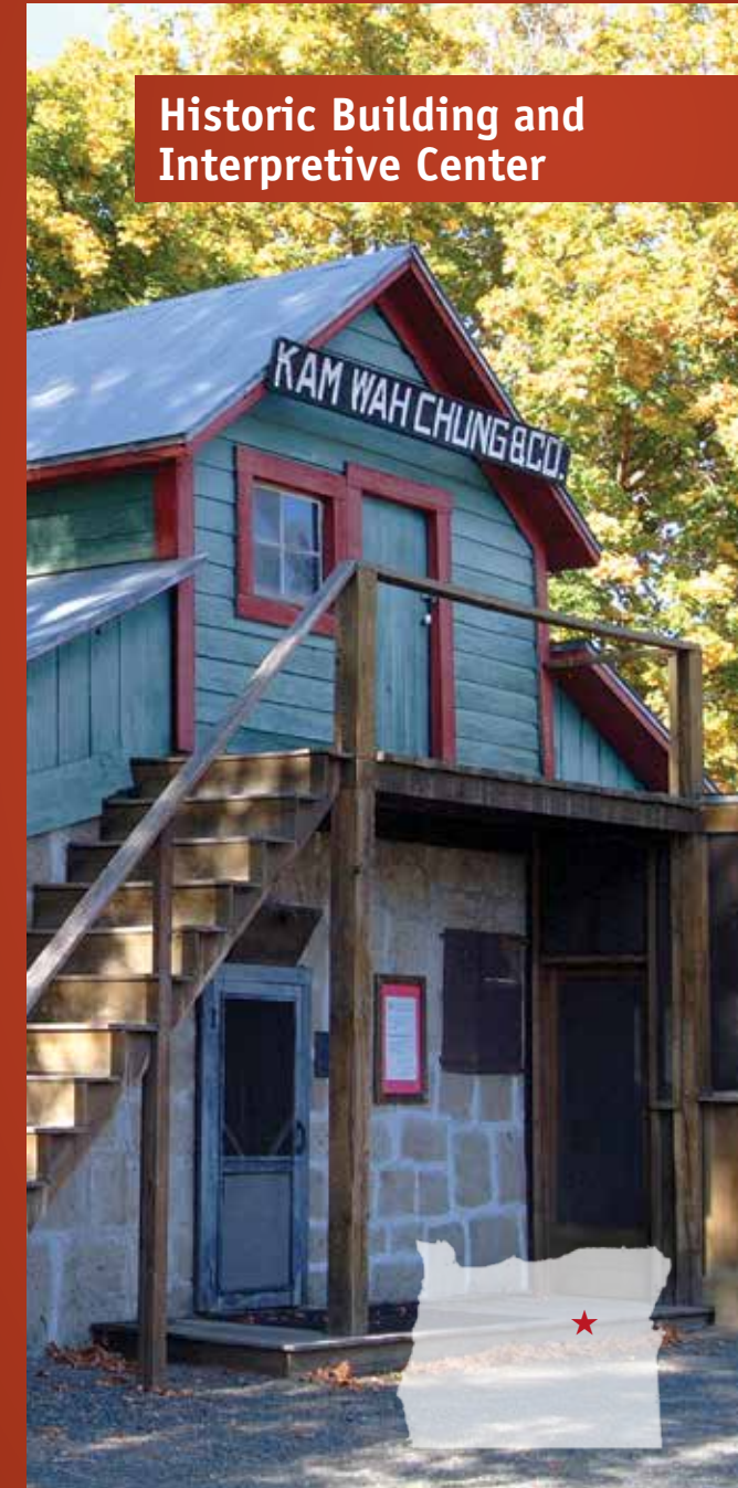
Historic Building and Interpretive Center