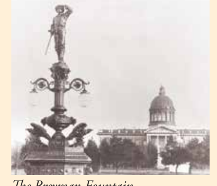
The Breyman Fountain

The Breyman Fountain is the only historic object remaining in Willson Park today. The fountain, originally used as a horse watering trough, was a gift to the city